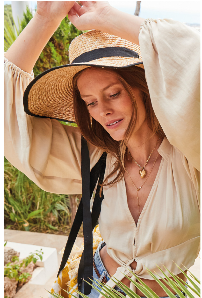
He loves me, he loves me not...